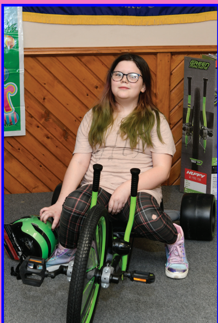
8 through 11