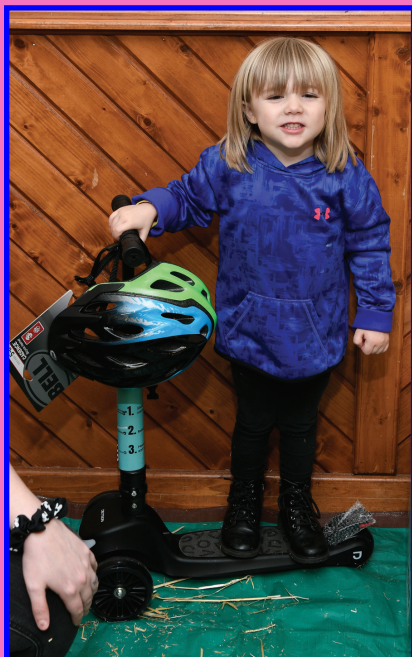
3 and Under