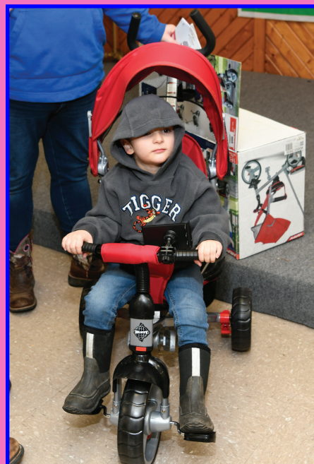
4 through 7