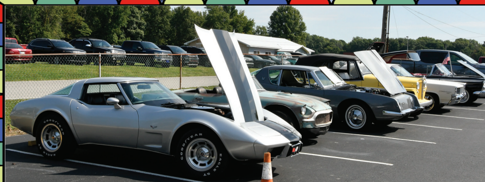
Antique Cars and Motorcycles