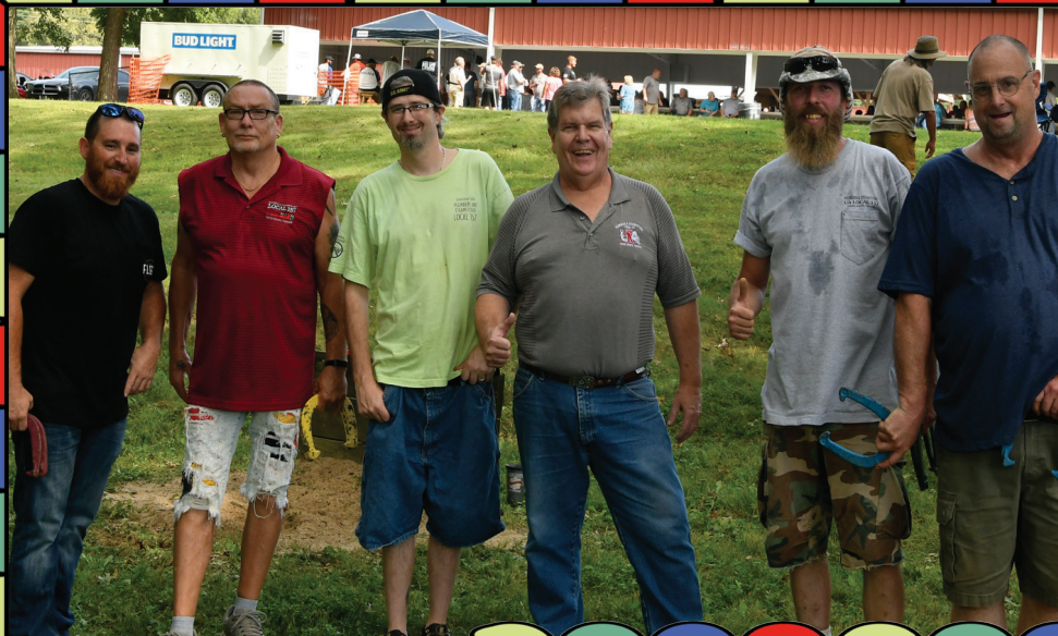
The Horseshoe Crew