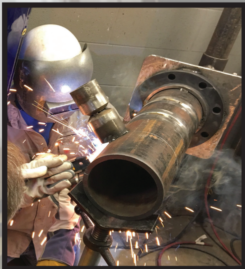
Brady Ramsey - Welding