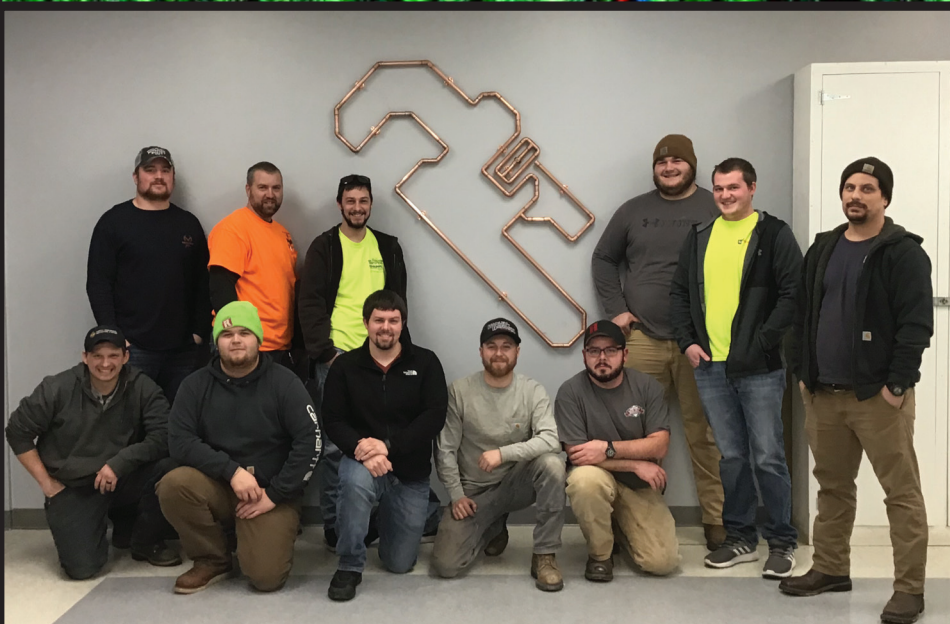
Lafayette 2nd Year Apprentices Drafting Copper Project