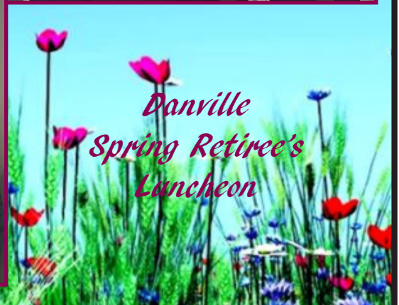
Danville Spring Retiree's Luncheon