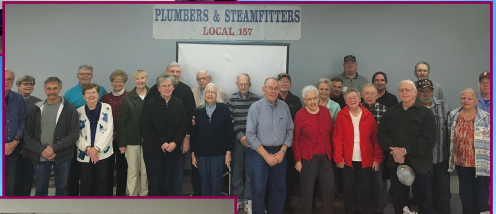
Lafayette Spring Retiree's Luncheon